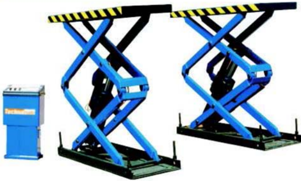
OVERALL STRUCTURE SIZE (mm)