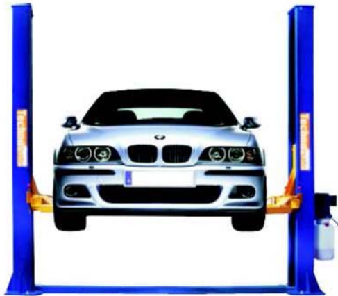
OVERALL STRUCTURE SIZE (mm)