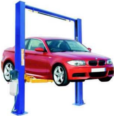
OVERALL STRUCTURE SIZE (mm)